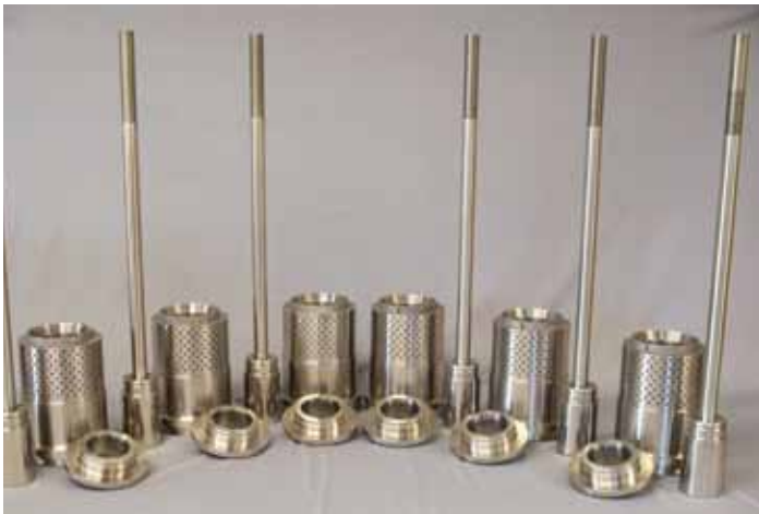
Fisher® 3" EHT CAV III Plug & Stem Assemblies, Seat Ring & Cages