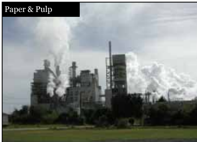
Paper & Pulp