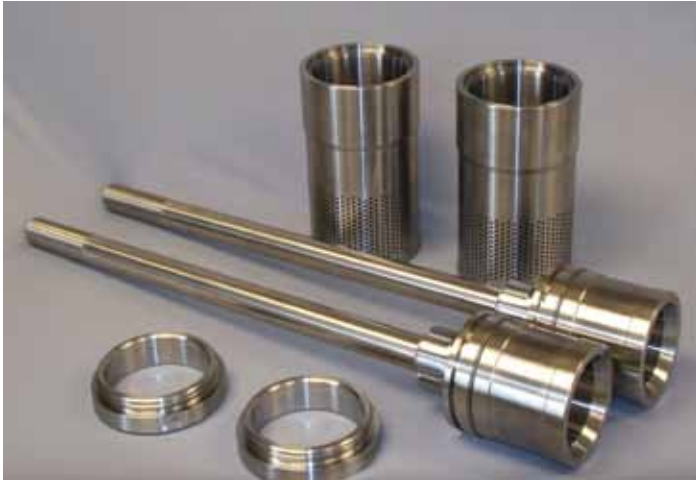
Fisher® 10" CVX Plug & Stem, Seat Ring and Hole Pattern Cage.