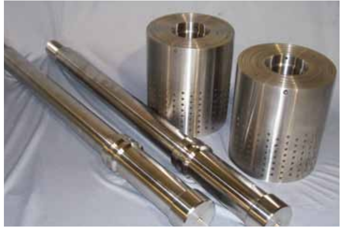
Valtek® 6" Unbalanced Channel Stream Valve Trim