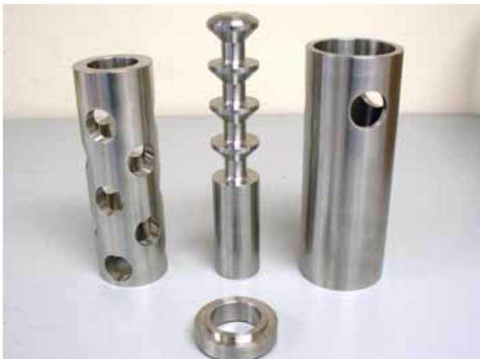
Masoneilan® 78,000 Series Trim Sey