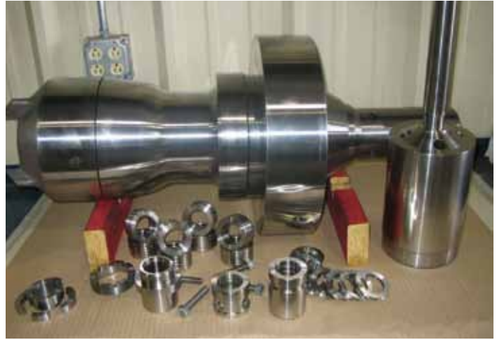
Siemens® High Pressure Main Control Valve Bonnet with Spindle & Bushings