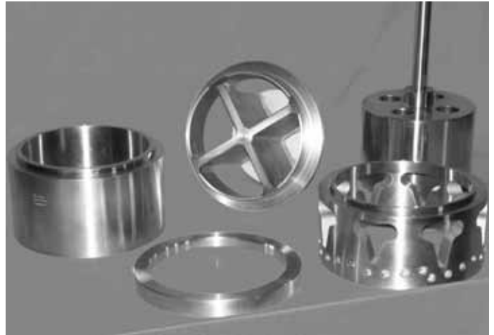
Copes-Vulcan® 10" Trim Set