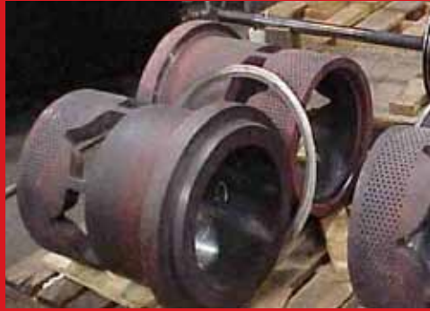
Fisher® 20" EHD Plug & Stem Assembly with Cage