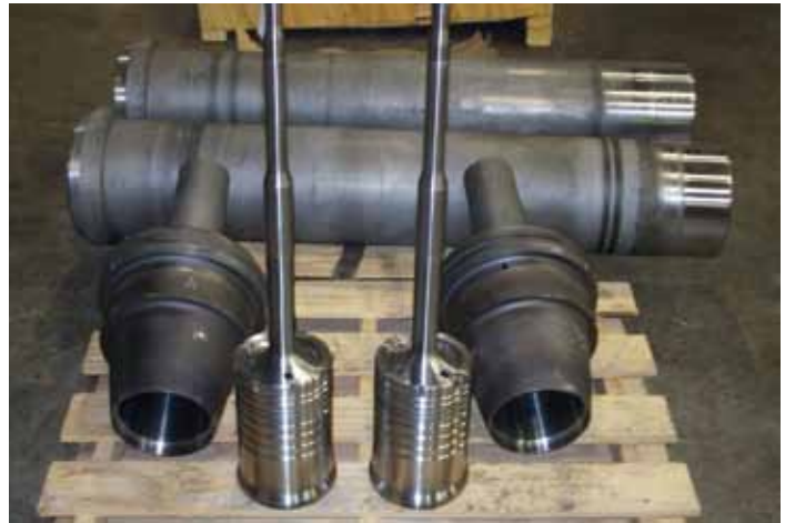
Alstom® High Pressure Spindles, Locks & Seat Chambers