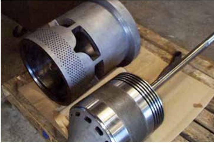
Fisher® 20" EHD Plug & Stem Assembly, Seat Ring & Cage