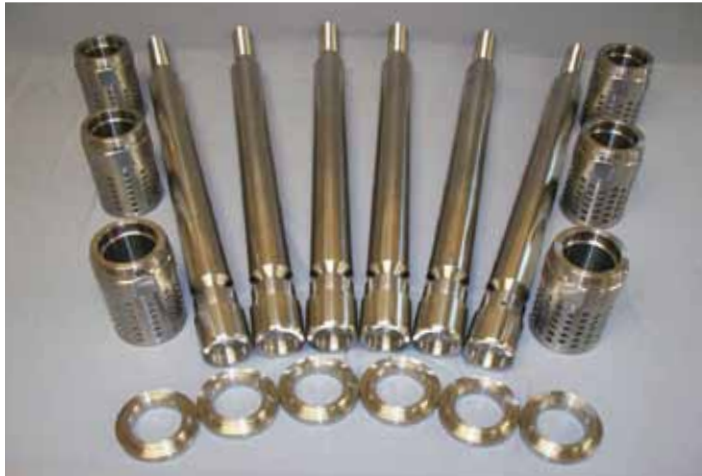
Fisher® 6" CAV IV Trim Set