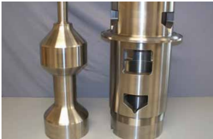
Bailey® 10" Plug & Stem Assembly with Seat Cage